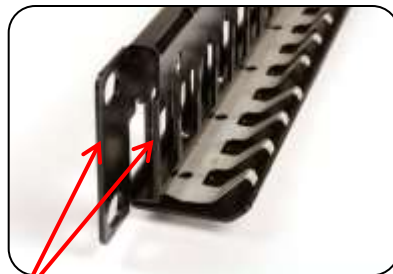
DOUBLE WALL ALLOWS FOR KEYSTONE JACKS TO SIT FLUSH WITH THE FRONT OF THE PANEL

The Americas Watertown, CT USA Phone (1) 860 945 4200