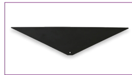
Angled Panel Cover