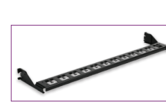
1U 48-Port Rear Cable Manager