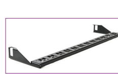
1U 24-Port, 2U 48-Port Rear Cable Manager