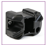
Palm Guard Insert