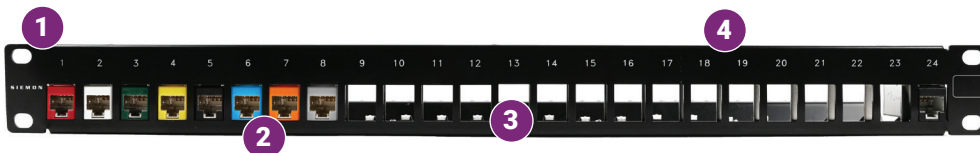
24-Port Flat Panel

Siemon's keystone category 6A shielded patch panels have been designed to be a flexible, modular termination solution for telecommunication rooms, data centers and larger consolidation point enclosures. These panels are part of our Solution 6A shielded system and are available in 24-port, 1U, flat and angled versions to support various configurations.