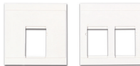
45mm x 45mm adapter, no label