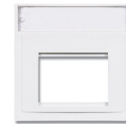
2-Port 50mm x 50mm adapter with label