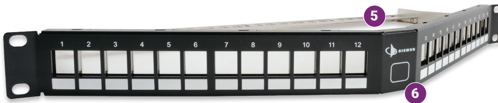
24-Port Angled Panel