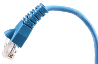
Strain and bend relief provides improved plug-to-cable retention and maximum performance by preventing pair deformation, as caused by mechanical strain