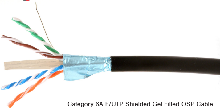
Category 6A F/UTP Shielded Gel Filled OSP Cable

Siemon's PowerGUARD technology with a 75° operating temperature improves heat dissipation for reduced length derating and bundling requirements in remote powering applications, including PoE and Power over HDBaseT (PoH)