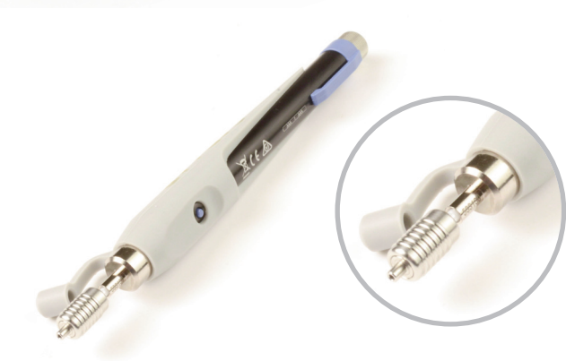
1.25mm Universal Connector Adapter – VFL with the optional 1.25mm universal connector adapter allows use with LC and MU connectors