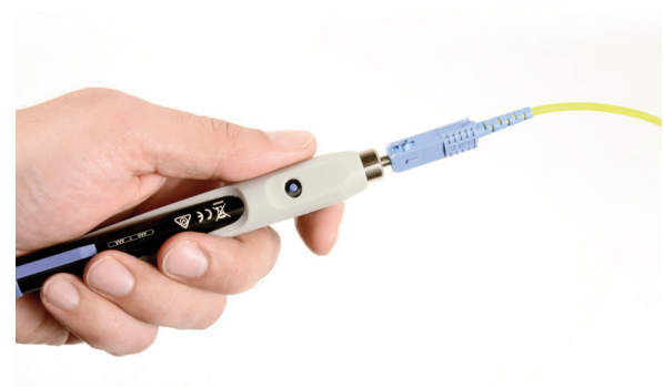
Handheld Pen Design – Small and ergonomically designed for fast and easy testing of connectors