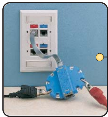
MODAPT.....Test adapter with one 152mm (6 in.) 4-pair universal plug-ended modular cord

One MODAPT allows access to 1-, 2-, 3-, and 4-pair keyed and non-keyed jacks and plugs