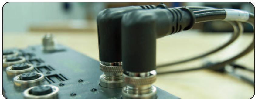
Resistant to dust, vibration and shock, the M12 D-Code is ideal for any industrial networking environment