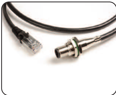
M12 cable assemblies can be configured with a variety of connector types including RJ45, straight and angled