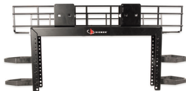
Parallel to Tray (Flush)