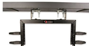
Parallel to Ladder Rack (Below)

Because we continuously improve our products, Siemon reserves the right to change specifications and availability without prior notice.