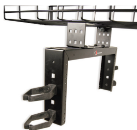
Perpendicular to Tray (Below)