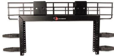
Parallel to Tray (Flush)