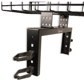
Perpendicular to Tray (Below)