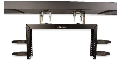
Parallel to Ladder Rack (Below)

Because we continuously improve our products, Siemon reserves the right to change specifications and availability without prior notice.