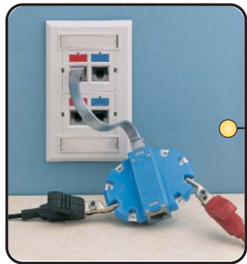
MODAPT.....Test adapter with one 152mm 4-pair universal plug-ended modular cord

One MODAPT allows access to 1-, 2-, 3-, and 4-pair keyed and non-keyed jacks and plugs