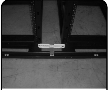
Make sure both cabinets that the Blank will be installed between, are level and properly bayed together using all (4) baying brackets. See Baying Instructions.