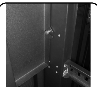
Place the Blank over the (4) shoulder bolts and hook the back plate into place.