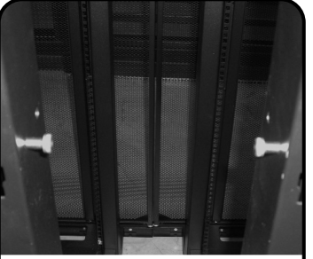
Install the (4) shoulder bolts provided onto the inside of the VPOD Frame as shown, using the 5/32" Allen Tool. (2) bolts on the top and (2) bolts on the bottom.